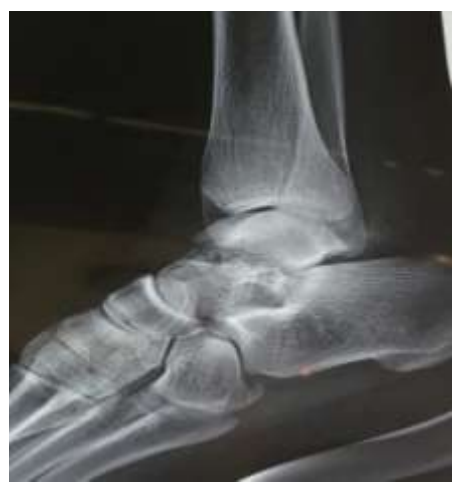
Figure 2b : Plain Radiograph lateral view showing Fracture neck of

Rest of the routine blood investigations were normal. While an open reduction and internal fixation is recommended for such type of fractures, which takes a lot of time for healing, with risk of infections, later need for re-surgery for implant removal and prolonged period of loss of working hours, in view of all the above complications we planned for a minimally invasive procedure. Two pairs of Kirschner wires, one inferomedially and another pair infero-laterally were inserted form dorsum of foot passing from talar head medially and laterally crossing the fracture site into the body of the talus in a converging fashion to provide more rigid and stable fracture fixation, without disturbing the articular surfaces under C-arm guidance after manual reduction(Fig.3a,b) Patient was immobilized with a below knee cast for about 4 week and was then mobilized once the Kirschner wires were removed. Ankle range of movements was upto near normal and satisfactory to us and to the patient as well.