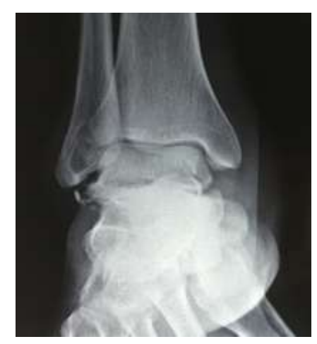
Figure 2a: Plain Radiograph AP view showing fracture neck of Talus with Lateral displacement(Hawkins

A 21-year-old male patient presented to the emergency department with pain and swelling in the right ankle with inability to bear weight over his right leg following a road traffic accident. On local examination there was a gross swelling over right ankle with no external injuries, with tenderness at the talar region and restricted range of ankle movements. Both anteroposterior and lateral radiographs revealed a displaced Hawkins type II talus fracture with incongruity of tibio-talar joint (Fig.2a,b).