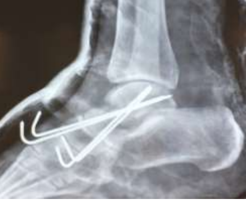
Figure 3b: Post-operative plain radiograph with Kirschner wires insitu, in Lateral View.

Figure 3a: Intra-operative Fracture fixation with Kirschner wires under C-Arm guidance. AP View.